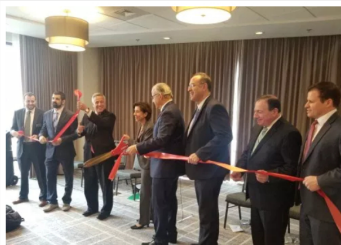
Gov. Gina M. Raimondo joined dignitaries at the Hilton Providence ribbon cutting